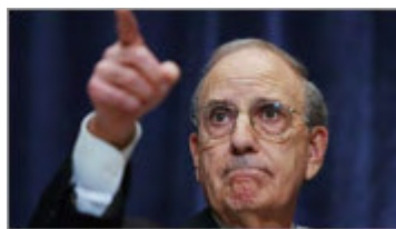
The Mitchell Report: Full coverage from the Globe