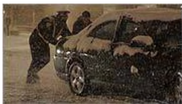
Scenes from Thursday's storm