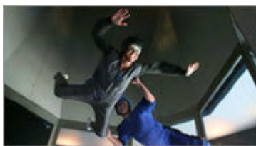
Check out 25 amazing New England travel adventure gifts